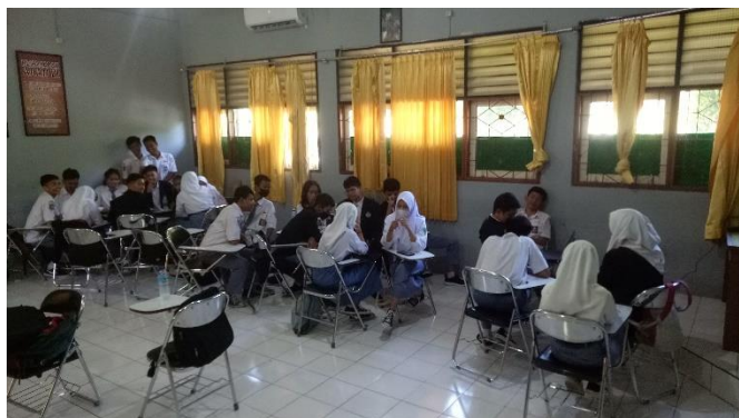
Figure 2. Student Activities in Preliminary Activities.

The implementation of community service at SMAN 5 Mataram is in the form of applying PhET learning media. Utilization of PhET media in learning has a positive impact on the learning process that is carried out. This is in accordance with Ladarna (2021) which states that PhET simulations have a positive influence on student activity in the learning process. Learning activities at each stage can be seen in several pictures taken in the learning process.