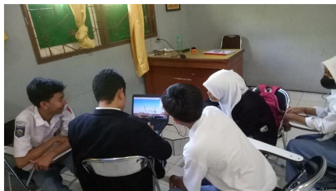
Figure 3. Student Activities in Group Discussion Activities.

Figure 2 shows the activities of students in the preliminary activities to build apperception and motivation. Students seemed more enthusiastic and focused on paying attention to the demonstrations displayed by the teacher. The demonstration presented is in the form of a video of the difference in the magnitude of the kinetic energy of an object moving in a curved path. This is done to generate student motivation and apperception to recall the subject matter about energy that was studied in junior high school.