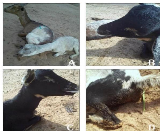
Figure 2. A. Two PPR Infected goats severely depressed goats, sleepy and discharges from nose and mouth. B and C: infected goat with mouth lesions, completely obstruct, and thick cheesy from mouth. D: PPR Infected goat with severe profuse watery diarrhea

Clinical examination was carried out on the animals' showing signs of disease. This included physical examination, observation of symptoms, and recording of details such as: