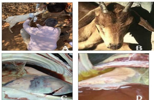
Figure 3. A: Expert collecting blood from CCPP suspected goat. B: Infected goat with severe depressed and dyspnea. C and D: Showed postmortem findings of lung abscess and pleural fibrosis of infected goat

Respiratory signs such as coughing, nasal discharge, and labored breathing, pleural exudates, dehydration due to fever and respiratory difficulty, sudden deaths, particularly in young goats and rapid spread of the disease among affected herds.