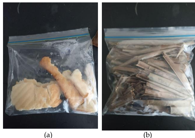
Figure 1. (a) FW; and (b) CW

an anaerobic state at temperature 35°C ( \pm 1 ) in an incubator for one week before being used. This activated the facultative anaerobic bacteria in the sludge (Ibro et al., 2022).