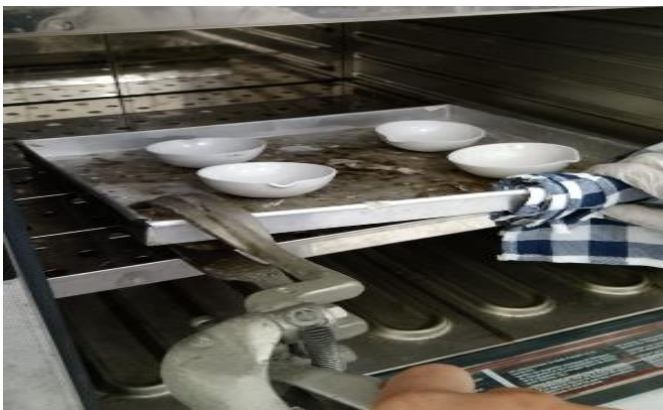
Figure 5. Heating the Glass Substrate

The next stage is the process of heating the sample using an oven at a temperature of 80° for ± 30 minutes. The aim of the sample heating process is so that the liquid in the solvent after deposition on the glass substrate can evaporate and only leave a layer with relatively the same thickness, as well as maximizing the formation of crystals on the substrate used (Maddu et al., 2018). The following is a picture of the glass substrate oven process to obtain a thin layer sample.