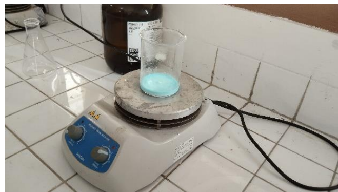
Figure 2. Process for Making Sol-Gel Solution

mixed and heated using an MSH-300 magnetic stirrer for 20 minutes. The heated solution was added to ethanol and titanium for 30 minutes to obtain a homogeneous solution. The aim of stirring the solution in a glass using a magnetic stirrer is so that all the ingredients mixed can become a homogeneous mixture and do not settle (Tebriani, Syukri, & Dahyunir., 2013). The following is a picture of pure titanium with added cobalt doping resulting from the solution-making process.