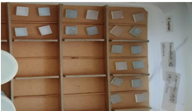
Figure 6. Thin Layer Samples with Concentrations of (0, 3, 6, 9, 12)%.

After the oven process, let the glass sit for ± 1 minute before removing it from the porcelain cup. The glass substrate has different colors before and after the deposition and heating process. The appearance of the sample obtained from the heating process is that when using a pure TiO 2 solution, the color of the glass becomes dark white and thicker than when using a solution with cobalt doping added. The following displays a sample obtained from the heating process.