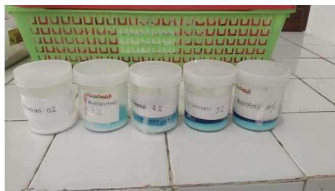
Figure 3. TiO 2 Solution with Concentrations of (0, 3, 6, 9, 12)%

From this image, it can be seen that there is a color difference between the solution with cobalt doping and the solution without doping. The pure TiO 2 solution without cobalt doping has a white color, while the solution added with cobalt doping has a darker color. It was found that the higher the amount of doping used, the clearer the resulting solution, and conversely, the lower the doping used, the darker the resulting color. Cobalt is a hard but brittle metal, bluish white in color, not very reactive, and dissolves in dilute mineral acids very slowly (Considine, 1981).