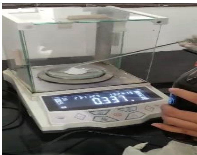
Figure 1. Process of Weighing Titanium and Cobalt

The following is a picture of the preparation process for the materials used to make the sol-gel solution.